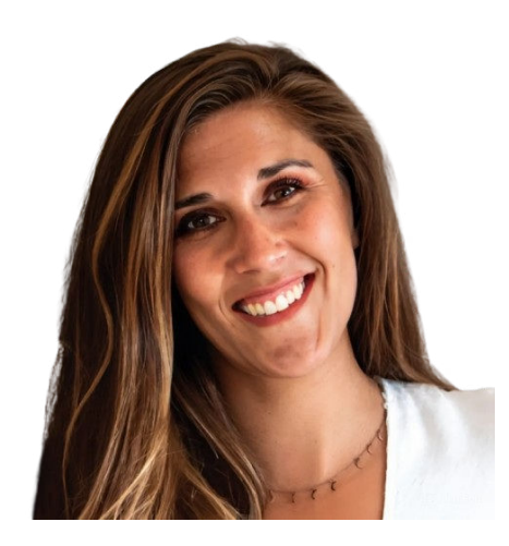
The Aligned Practitioner: Ergonomic Excellence in Dentistry