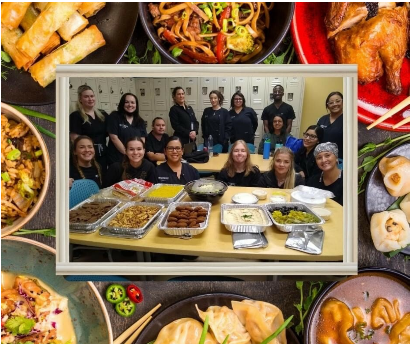
SADHA at Arizona Dental Mission of Mercy.