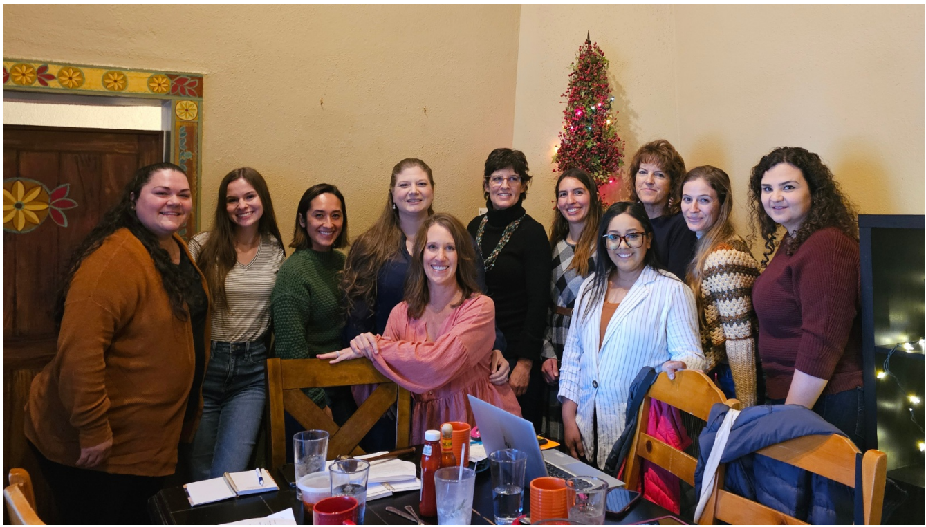
SADHA Board yearly planning meeting.