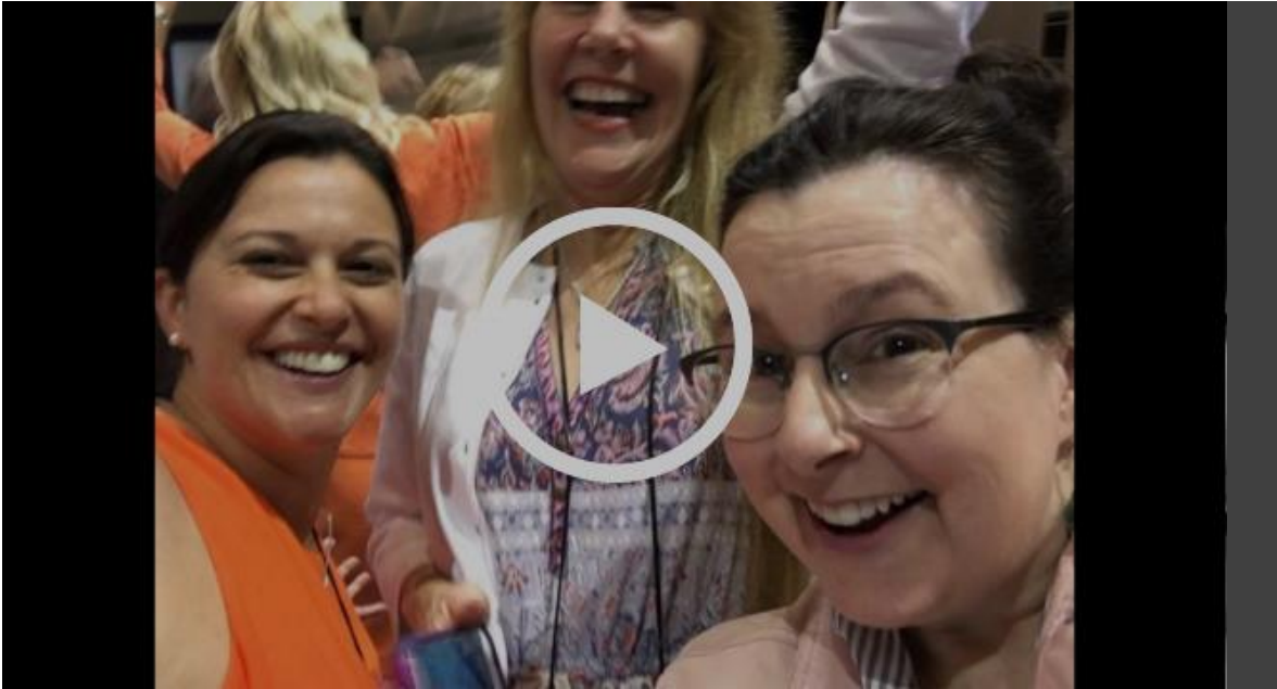
Arizona Dental Hygienists' Association, District XI, Delegates and Alternate Delegates at the ADHA 95th Annual Conference